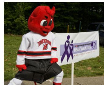
Scorch, mascot of the Trenton Devils Hockey Team, led the Family Health Walk at the Annual RUN FOR MOM on Mother's Day